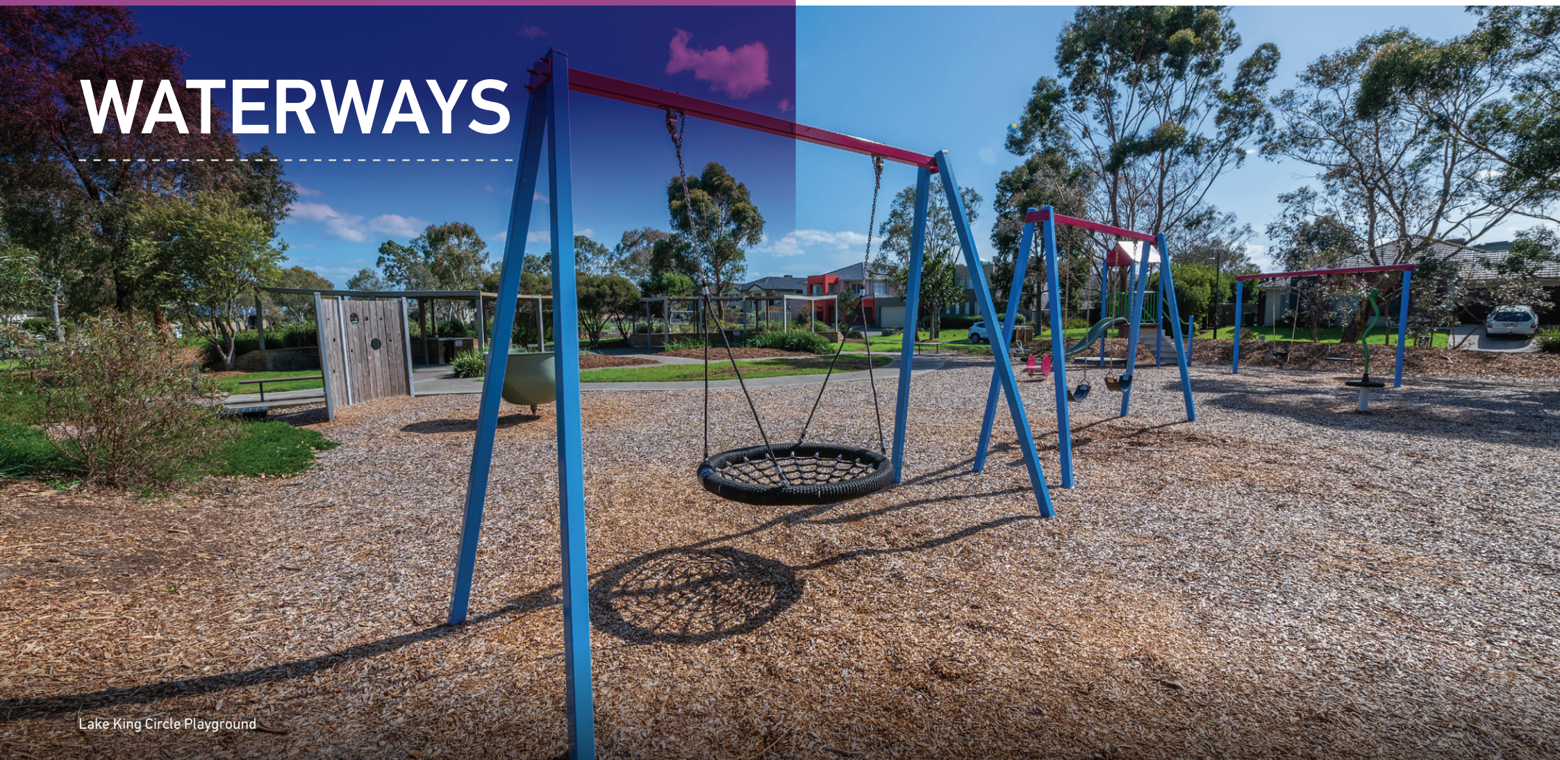
Lake King Circle Playground