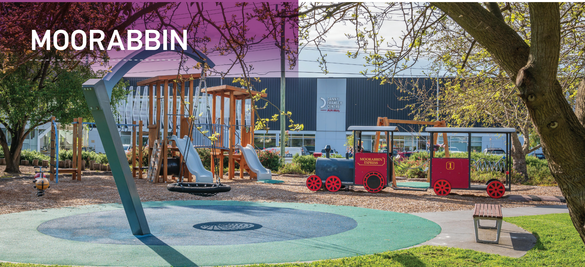
Perry Street Playground