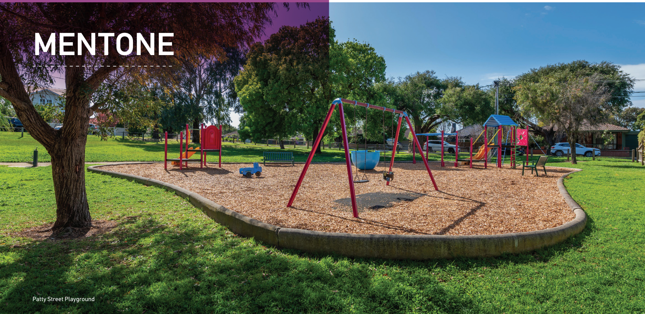
Patty Street Playground