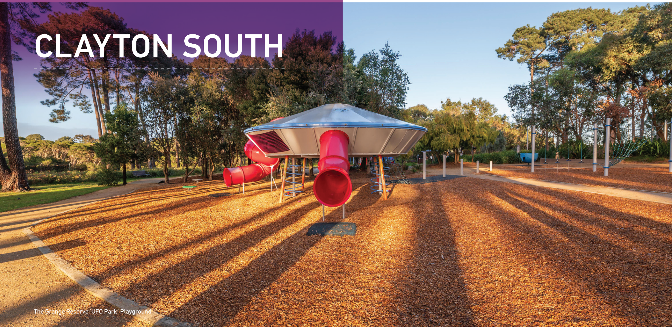
The Grange Reserve 'UFO Park' Playground