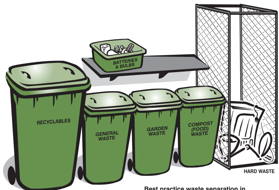
Best practice waste separation in multi-unit residential developments.

Construction sites can represent a great burden on local waterways. Site litter, paint, solvents, bricks, cleaning substances and clean-fill can all contaminate stormwater runoff. It is an offence under the Environment Protection Act to discharge contaminated water into the stormwater system. To avoid contamination, ensure that a drainage system is installed before construction activities commence and storm water is diverted from areas where soil is exposed.