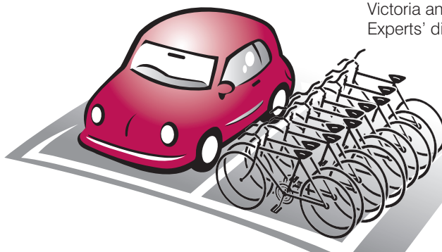
One car space can usually be converted to 10 to 14 bike parking spaces.

In recent years, the bicycle industry has developed a wide range of parking solutions addressing product selection criteria, such as space availability, user preferences and security requirements. The table below provides an overview of the most common bicycle parking systems. For further details, we recommend referring to the 'Bicycle Parking Handbook' from Bicycle Network Victoria and talking to their 'Bike Parking Experts' division