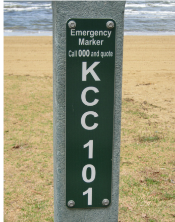
An example of the green and white emergency markers quote the unique code when you call 000.

ESTA will also be able to note directional information about the location, such as the quickest access points, road closures and any potential obstructions.