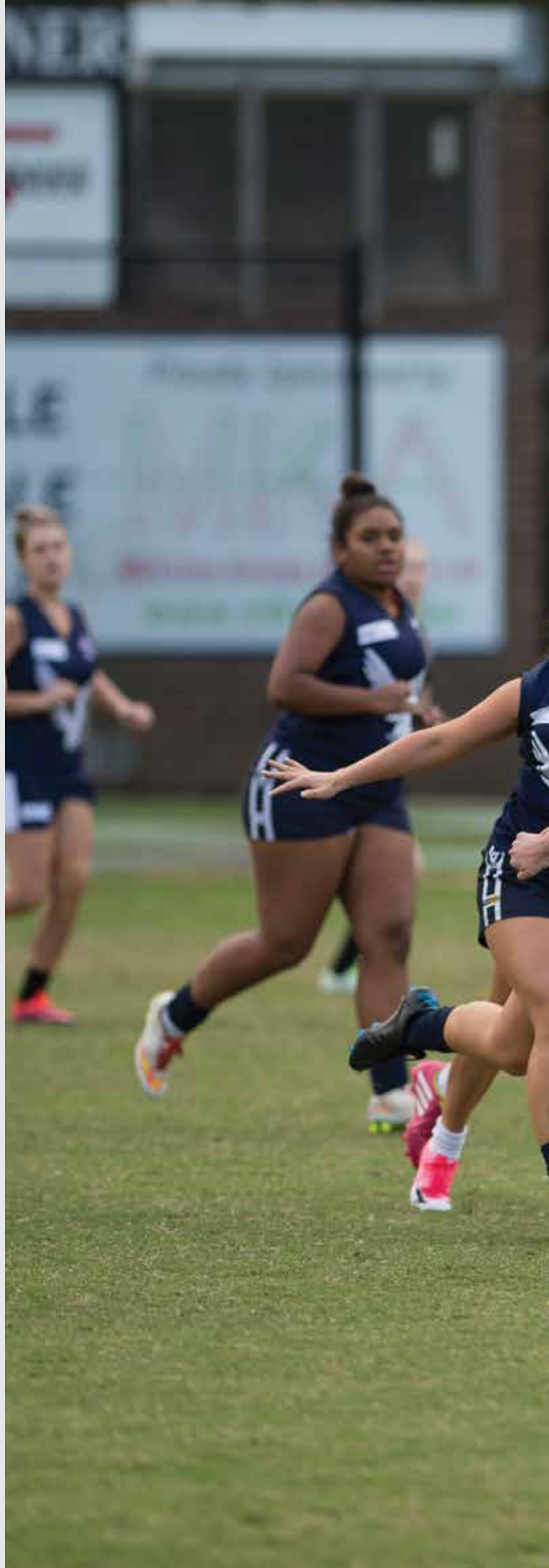
Cr Steve Staikos Mayor

A handwritten signature in black ink that reads "Steve Staikos". The signature is written in a cursive, flowing style.