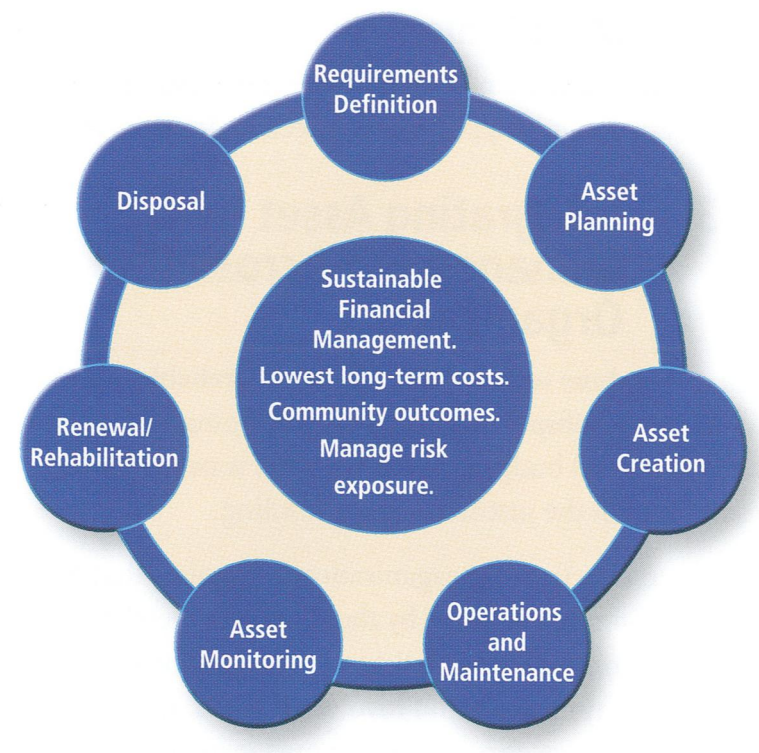
Source – International Infrastructure Management Manual Asset Lifecycle