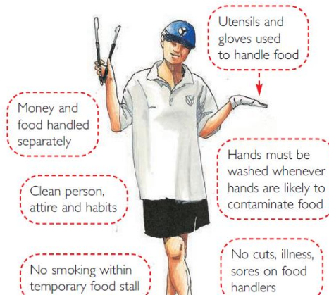
Image Source: 'Guidelines for Temporary Food Stalls,' Department of Health and Human Services, Tasmania