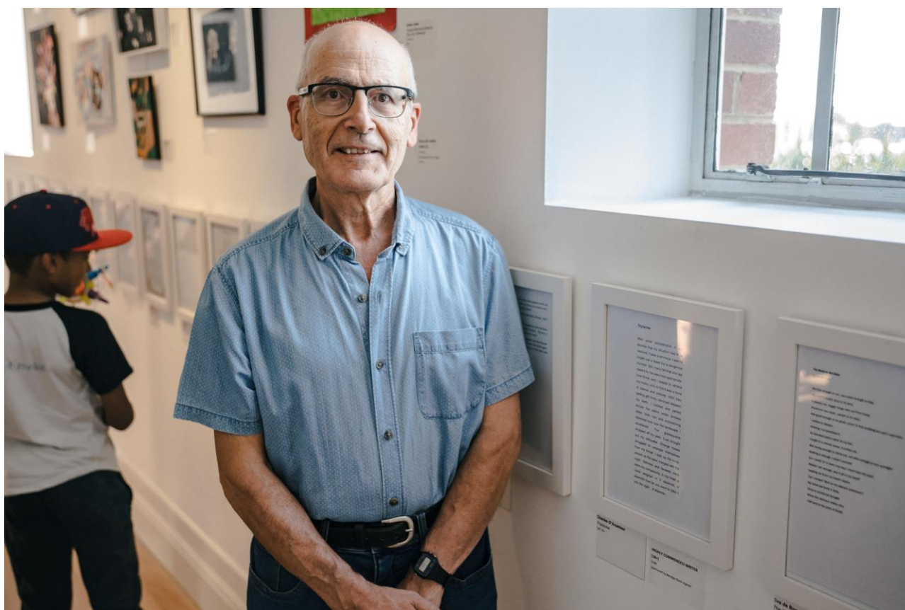
Image of Artz Blitz 2019 exhibition opening.

Good luck! We hope that the experience will be incredibly inspiring, rewarding and fun!