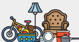
Household furniture, toys, bikes, pots and crockery