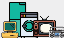
Electrical appliances and e-waste

PLUS Bikes, BBQ's, scrap metal (up to 1.5m long), small car parts, lawn mowers, tools, mirrors / windows (securely wrapped in cardboard marked 'glass'), empty paint tins (lids off), hot water services, fridges / freezers (doors removed) and electrical appliances (must be able to be lifted to shoulder height by two persons)