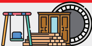
Items over 1.5m in length or over 55kg