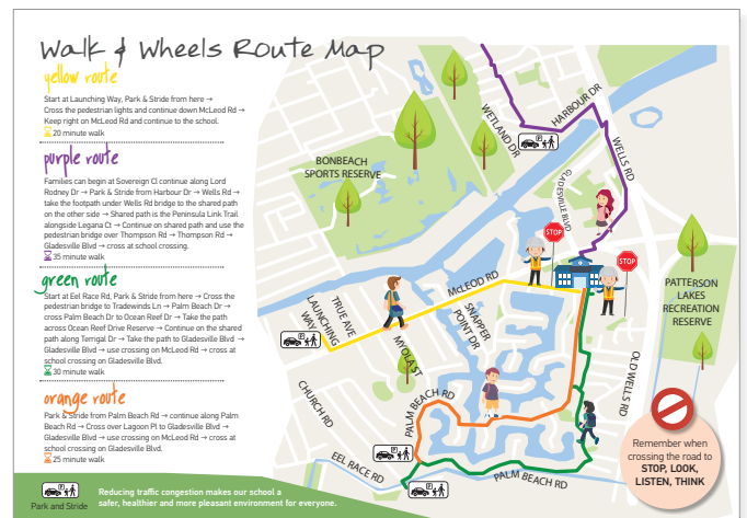
Example of the Walk and Wheels to School Route map provided for the school community. The map includes park and stride points.