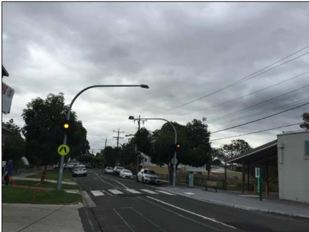
Example: crossing without flashing lights