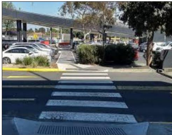
Example: crossing without flashing lights