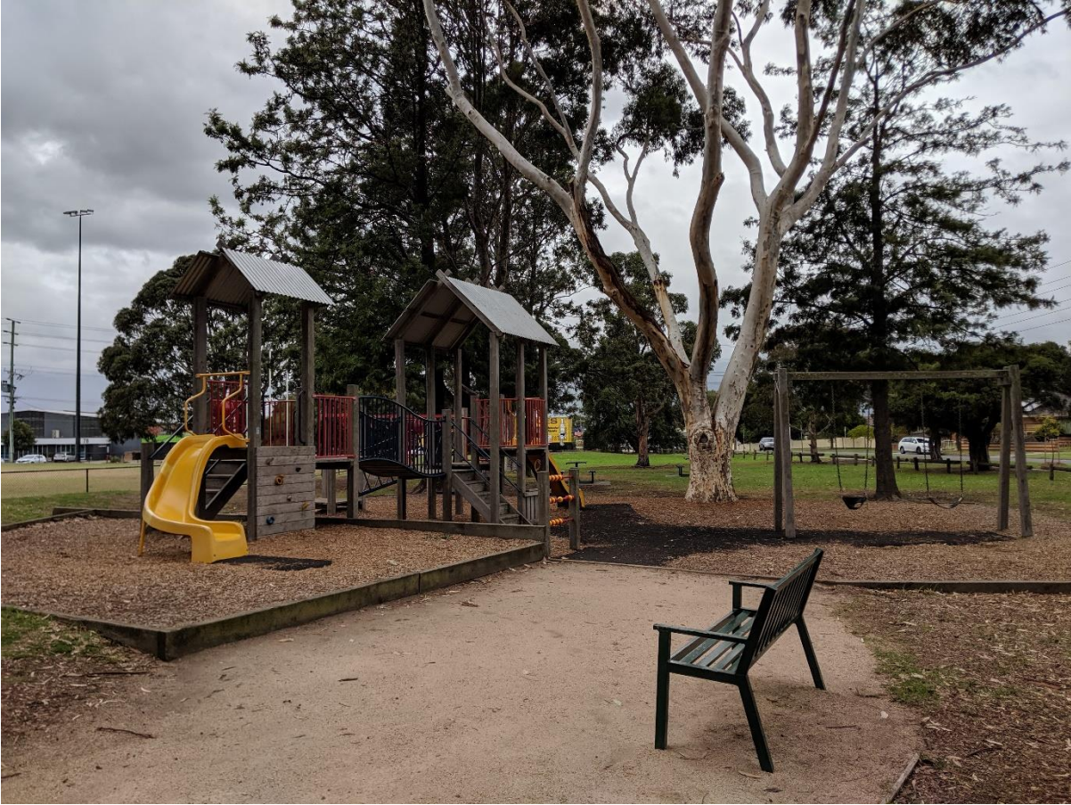
Existing playground, to be demolished