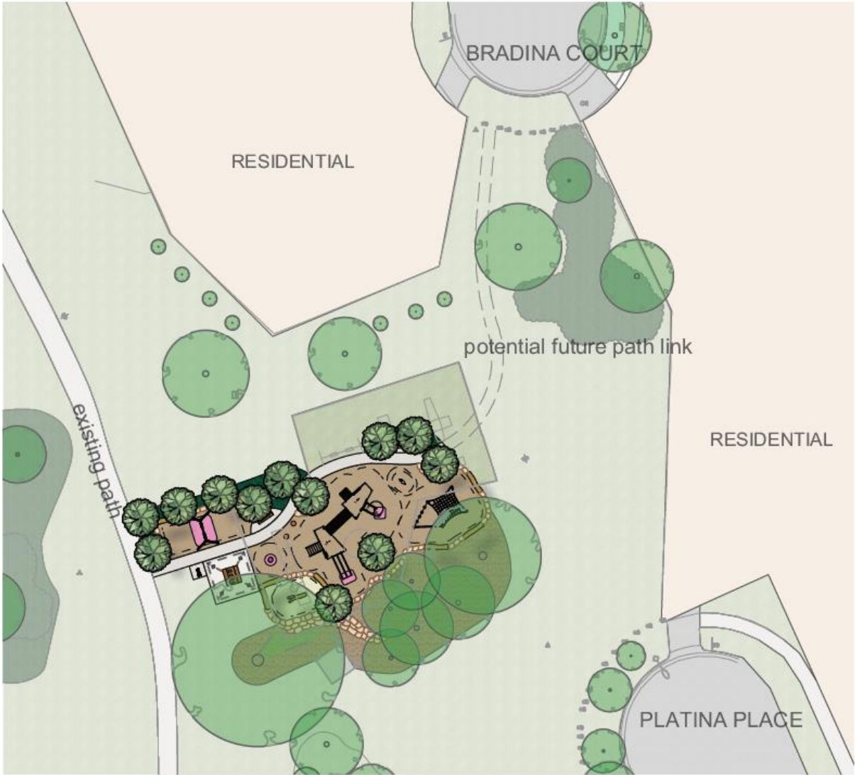
Location of playground, path network and planting