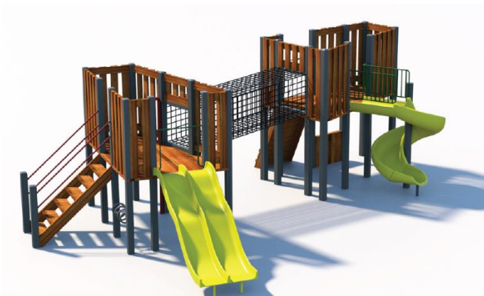
Custom combination unit