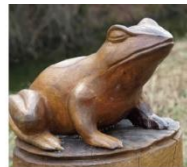
Themed wood carvings